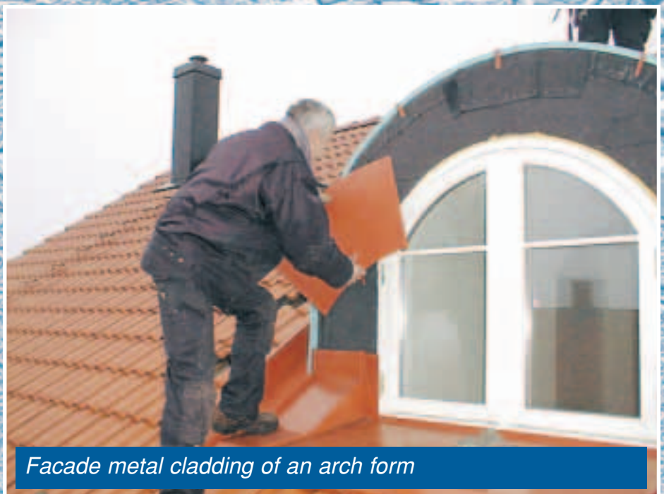
Facade metal cladding of an arch form