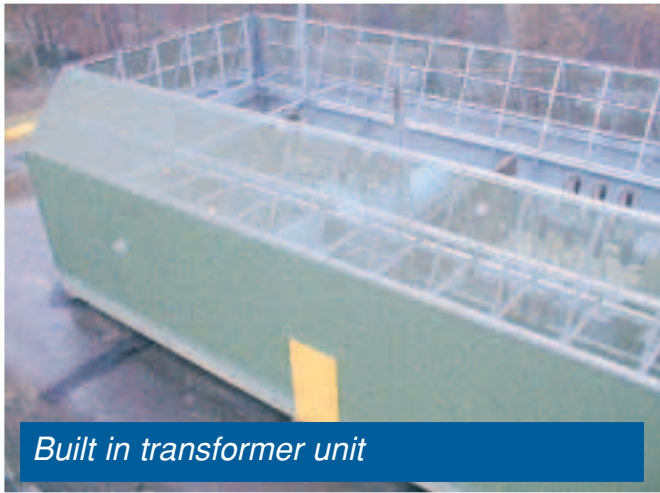
Built in transformer unit

Specialists in construction and sheet metal working